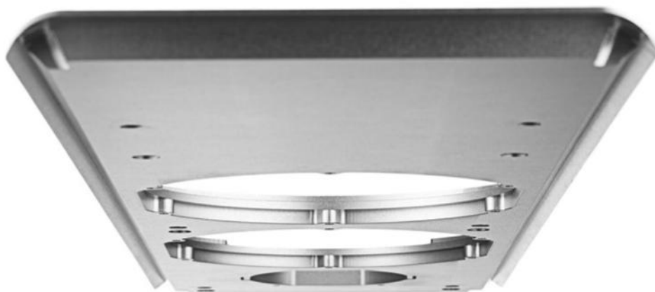
▽ A MASSIVE MACHINED ALUMINIUM FRONT BAFFLE IS THE NON-RESONANT PLATFORM USED TO HOUSE THE DRIVER UNITS.

craftsmanship is evident in the construction, as well as from the literature that comes with the speaker. It's a good read and obviously the result of a passionate company culture.