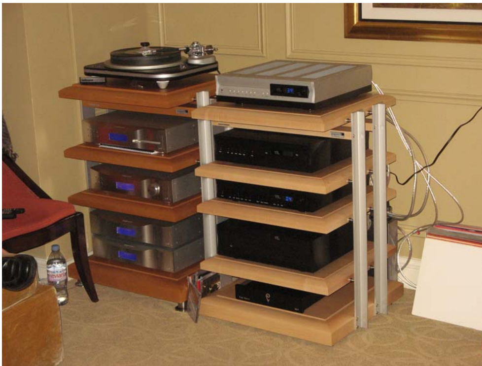
Front End from left to right, top to bottom: Spiral Groove turntable, Paganini System, TL5.5 Series II Preamp with Phono (in silver), TP6.5 Phono (black), TL7.5 Reference Preamp (in black), Spiral Groove power supply