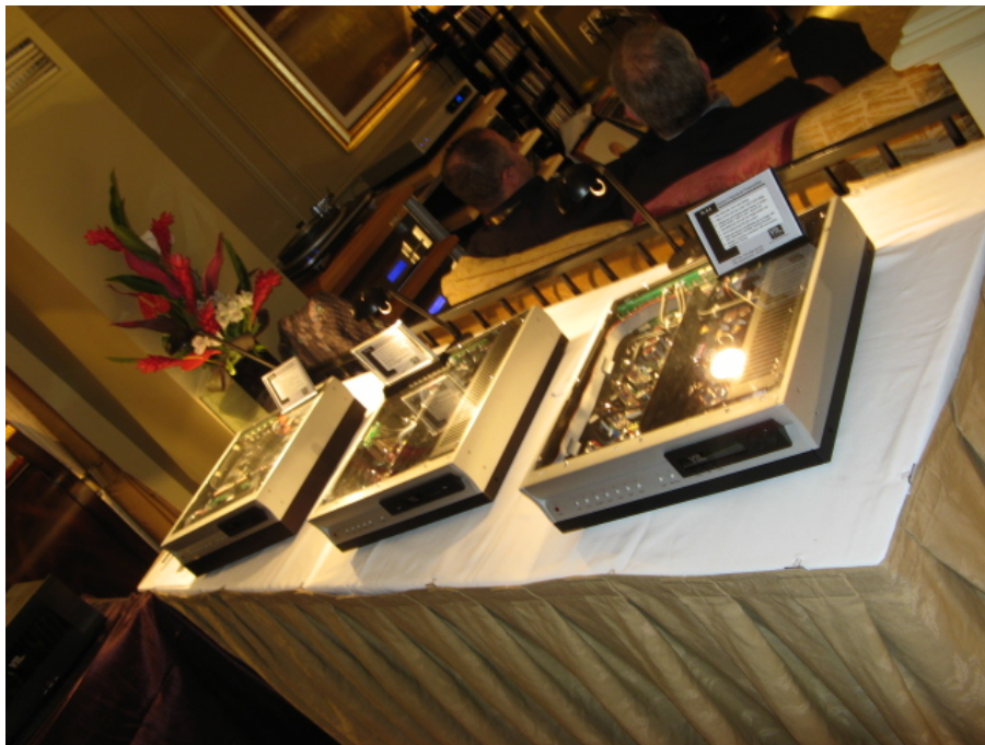
Static Display of the TL6.5, TP6.5 and TL5.5 II Preamplifiers