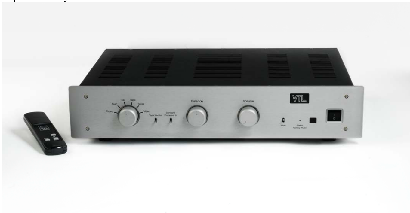
The “New Look” of the TL2.5 Preamplifier

At CES this year, we also introduced a new luxurious “make-over” for the TL2.5 preamplifier. This widely popular preamplifier has enjoyed a very long and stable shelf life of over 15 years, and finally this year, it is getting a complete update to its cosmetics to bring it in line with the rest of the products in the Performance Series with no changes in price. Order your new TL2.5 now -- new cosmetics available to ship immediately.