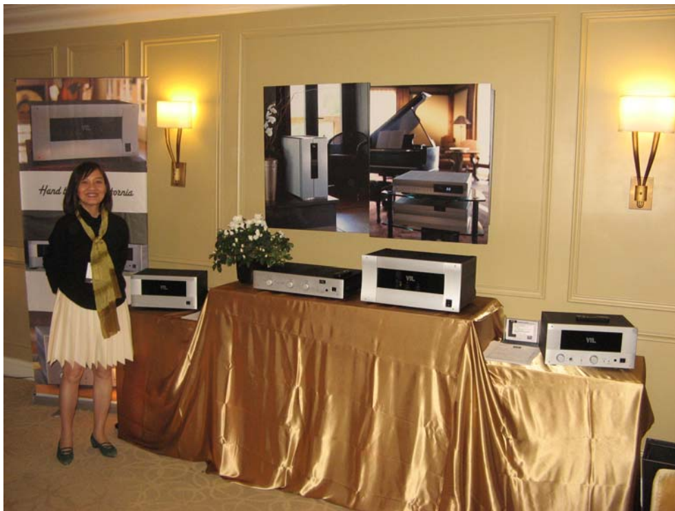
Performance Series Products on Static Display: MB-125, TL2.5 preamp, ST-150 and IT-85