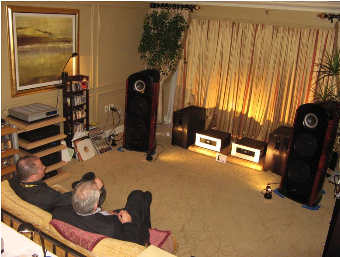
Active demo system with MB-450s, Siegfrieds, TAD speakers