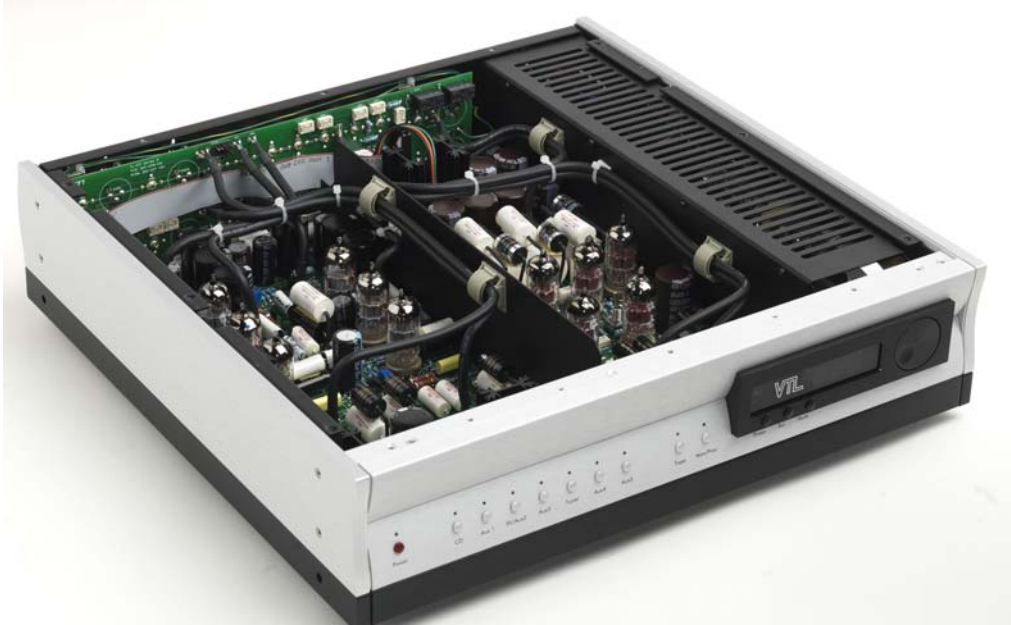
Internal view of the TL5.5 II Preamp with Phono

In addition to the demo unit, we also showed the TL5.5 II with phono in a static display with its top encased in a plexiglass to show the internal layout of the unit.